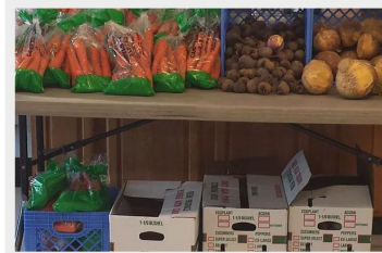
Food Distribution Volunteer