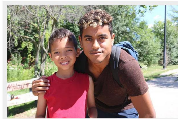
Summer Camp Volunteer