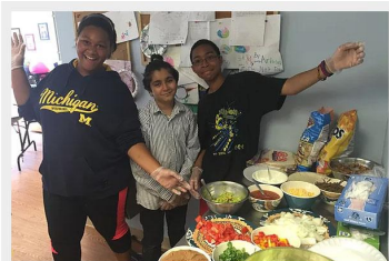
Make a Meal Volunteer