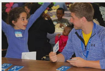
After School Program Volunteer