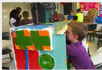
Art & Design Program Volunteer